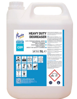
MERLIN C09 HD DEGREASER, 5L