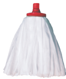
INTERCHANGE MOP HEAD